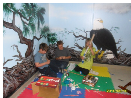
Caution: Boys at work.